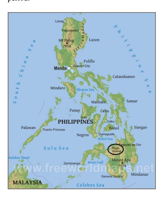
Figure 1: Map of the Philippines. The two white dots in the dark circle show the location of the cities of Iligan and Marawi in north-central Mindanao. Marawi is located on the north shore of Lake Lanao, about 700 meters above sea level. Pirandangan is located between the cities, about 350 meters above sea level.

Following a bottom-up approach, I began the study by mapping residential and livelihood patterns, focusing on actual land use. Together with farmers, I walked around the area, asking questions about their livelihood activities, listening to how they described changes in land use, and the stories they told about who had first cleared the land. I conducted open-ended, semi-structured interviews with men and women, early settlers and newcomers, and not merely with village heads. I mapped kinship relations (genealogies), inheritance rules and residence patterns. The NGO provided me with additional data on land use. I also paid attention to the relationships residents maintained with extra-local parties, including the NGO that helped me with my research. Focus was on the relationships that were used to help strengthen land claims, secure tenure and improve livelihoods. While each field trip was relatively short, repeat visits have allowed me to observe changes in land use, livelihoods and kinship over nearly a five-year period.